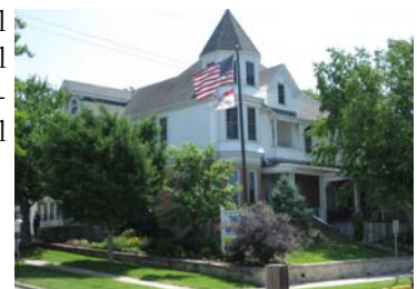
The donated Hospice House now provides a home for our Respite program..